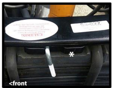
Place PSP11 on top of spring plate flat side up facing, with groove toward the front