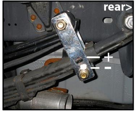
Select preload & ride height

Install rear shackle first followed by front shackle.