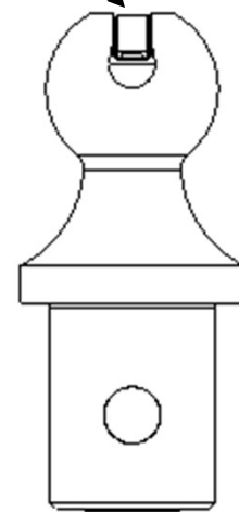
Figure 3 (Side View)